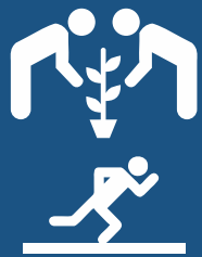
Garden & Jogging Track